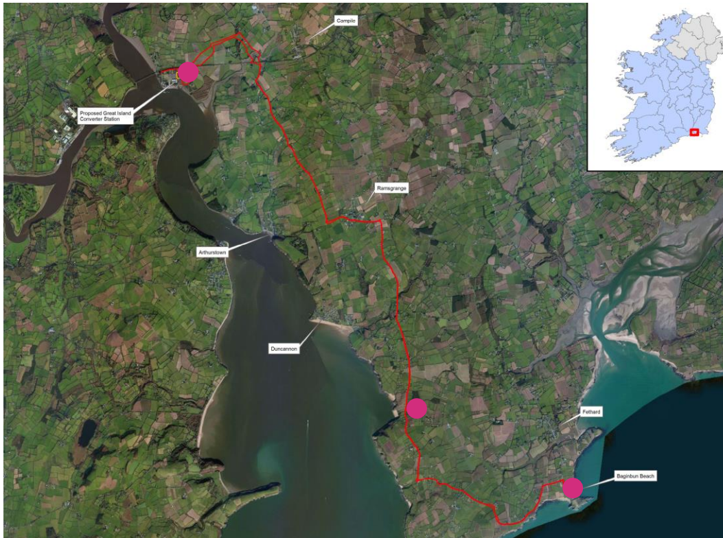
Figure 1: Cable Route and Locations of Construction Compounds (indicated thus ●)